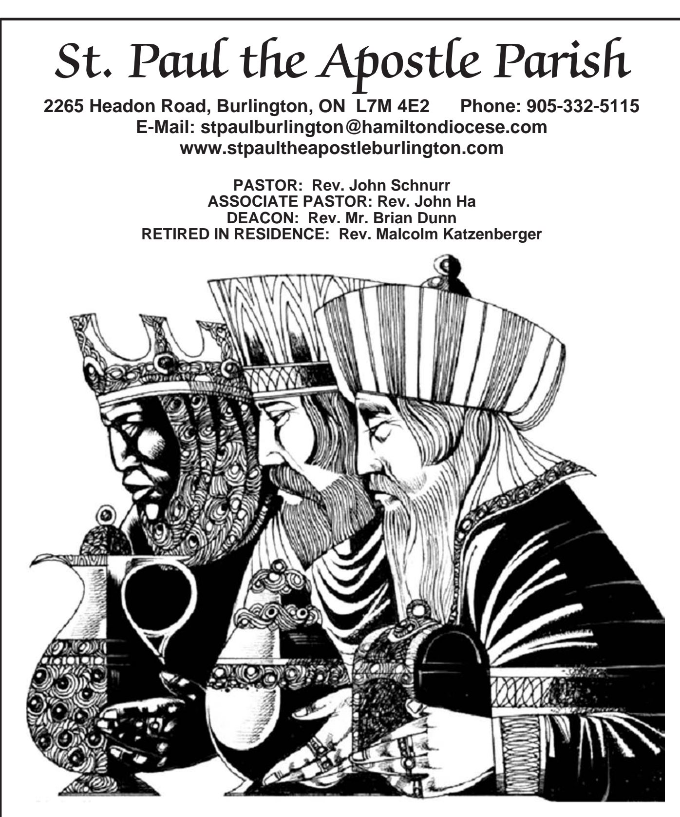
Father, You revealed Your Son to the nations by the guidance of a star. Lead us to Your Glory in Heaven by the Light of Faith.